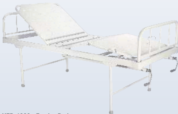
VFB-4003 Fowler Bed (Removable MS head & foot boards ) 2120mm (L) x 910mm (W) x 600mm (H) #