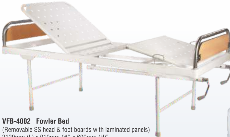
VFB-4002 Fowler Bed (Removable SS head & foot boards with laminated panels) 2120mm (L) x 910mm (W) x 600mm (H) #