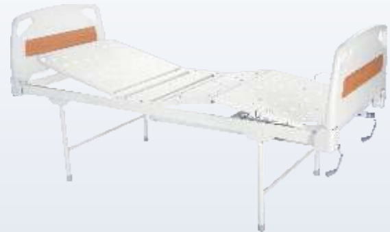
VFB-4001 Fowler Bed (Removable Polymer moulded head & foot boards) 2240mm (L) x 955mm (W) x 600mm (H) #